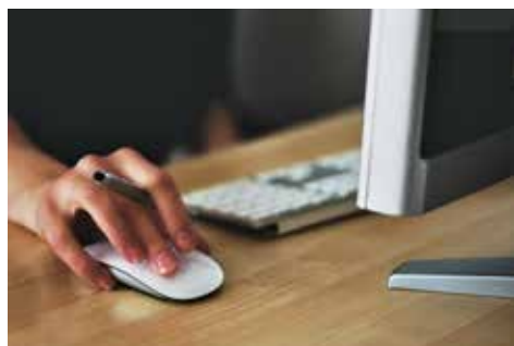
PHOTO EDITING AND DIGITAL ART WORKSHOP